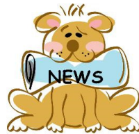
about Small Groups